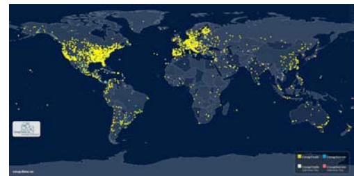
Figure 1. CmapTools users throughout the world.

The 2000's have seen a continuous growth in the use of concept mapping and in its applications. This growth is reflected in the extensive participation and wide-ranging topics presented at the Concept Mapping Conferences (Cañas & Novak, 2006a; Cañas, Novak, & González, 2004; Cañas, Reiska, Åhlberg, & Novak, 2008) and in the active Cmappers community (the informal community of concept mappers around the world). Figure 1 shows how CmapTools users connecting to CmapServers cover large portions of the world.